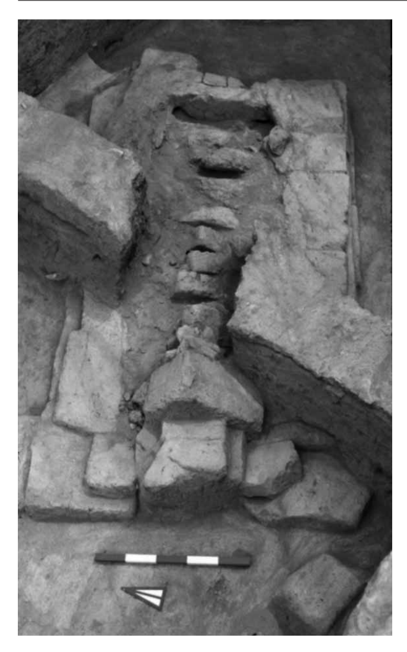
Fig. 4: A10.39B-a mock pitched roof tomb with two individuals inside: a young adult and a neonate.