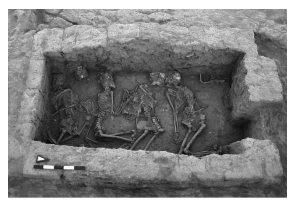
Fig. 5: A7.525/530 – a built chamber tomb where 5 adults and one child were buried inside, following the same orientation but not the same position.