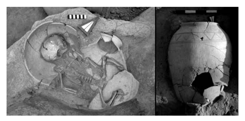
Fig. 2: A child in situ buried inside a jar; to the right – one of the jar burials found in Mozan with a child inside.